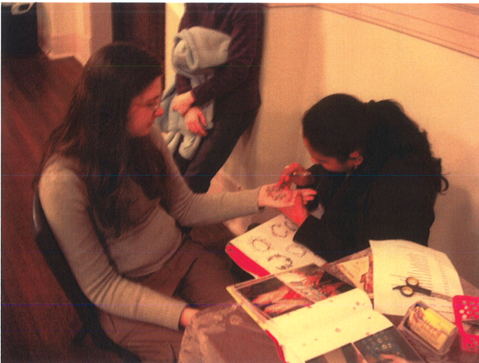
Henna at Bollywood Nite Function