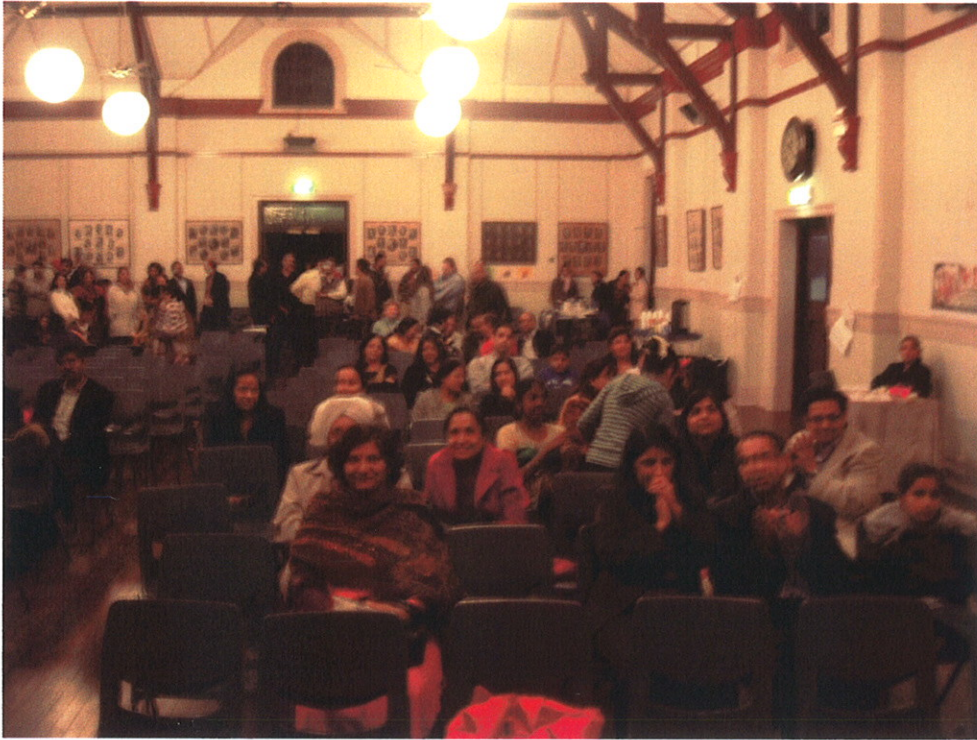
Bollywood Nite Function