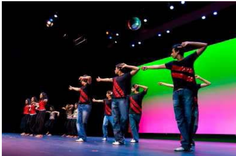
Urja Group's Spectacular Performances