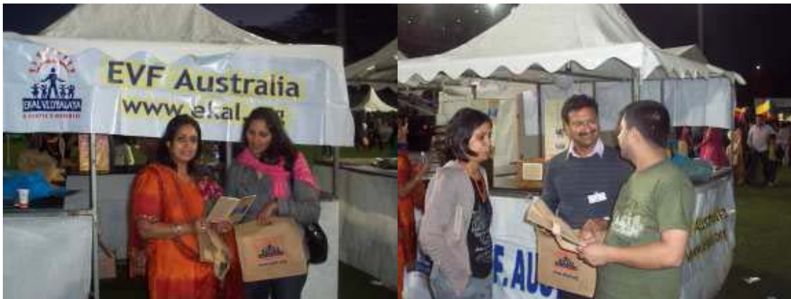
Ekal Stall at the Deepavali 2009 Fair

EVF Australia was provided with an opportunity to share a stall at this Fair. EKAL volunteers presented at this entire bright and colorful event to promote the EKAL cause by reaching to larger community. Volunteers distributed EKAL bags and brochures. They explained and answered the questions people had about EKAL.