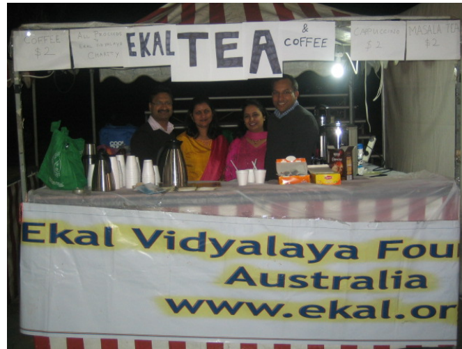
Ekal Volunteers at the Stall

Ekal volunteers set up a tea stall at the Garba function organised by Gujarati Samaj in Lidcombe, Sydney. With more than 1,500 people attending the function over 3 days, it was a great opportunity to promote the Ekal cause.