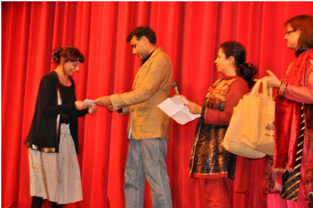
Raffle Prize Distribution