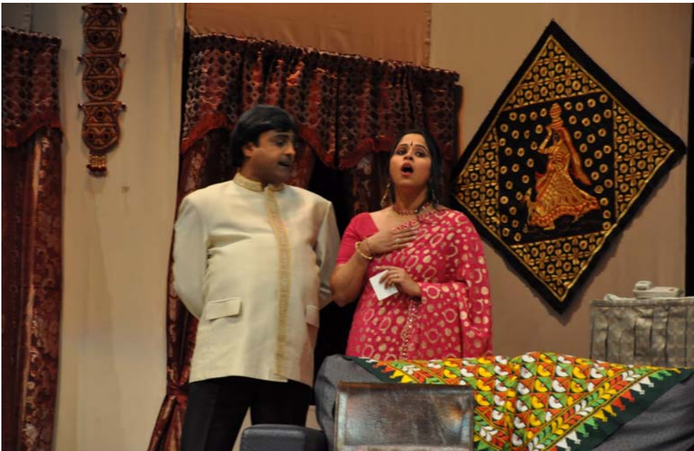
Stills from the Drama