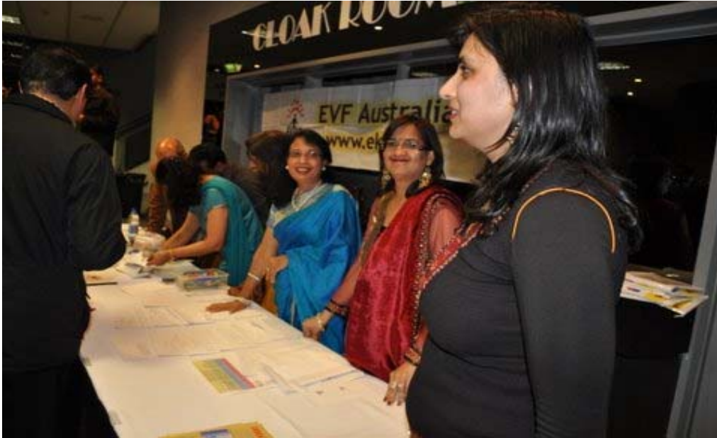
Volunteers Helping Out at the Front Desk